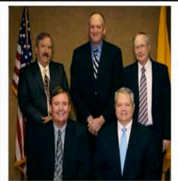
Lea Co Board of Commissioners