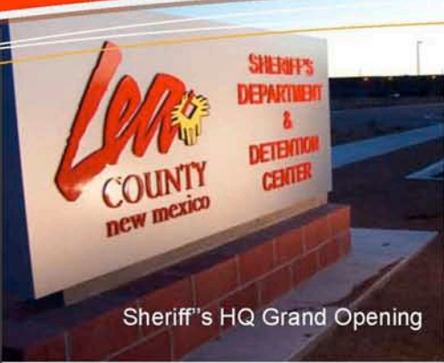
Sheriff's HQ Grand Opening

The LCBC are committed to continuing this growth throughout 2012. In addition, they strive to provide an excellent quality of life for our citizens through the year.