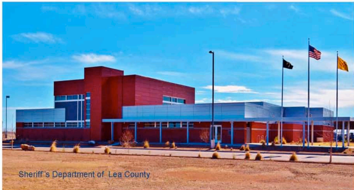
Sheriff's Department of Lea County